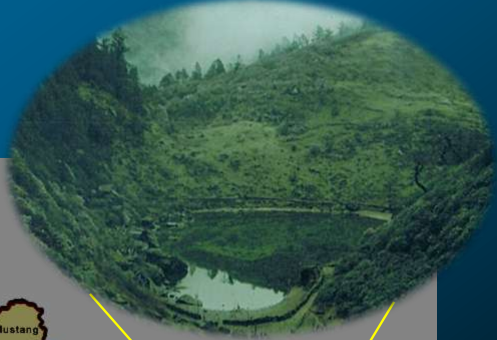
Salpa Pokhari (Lake)